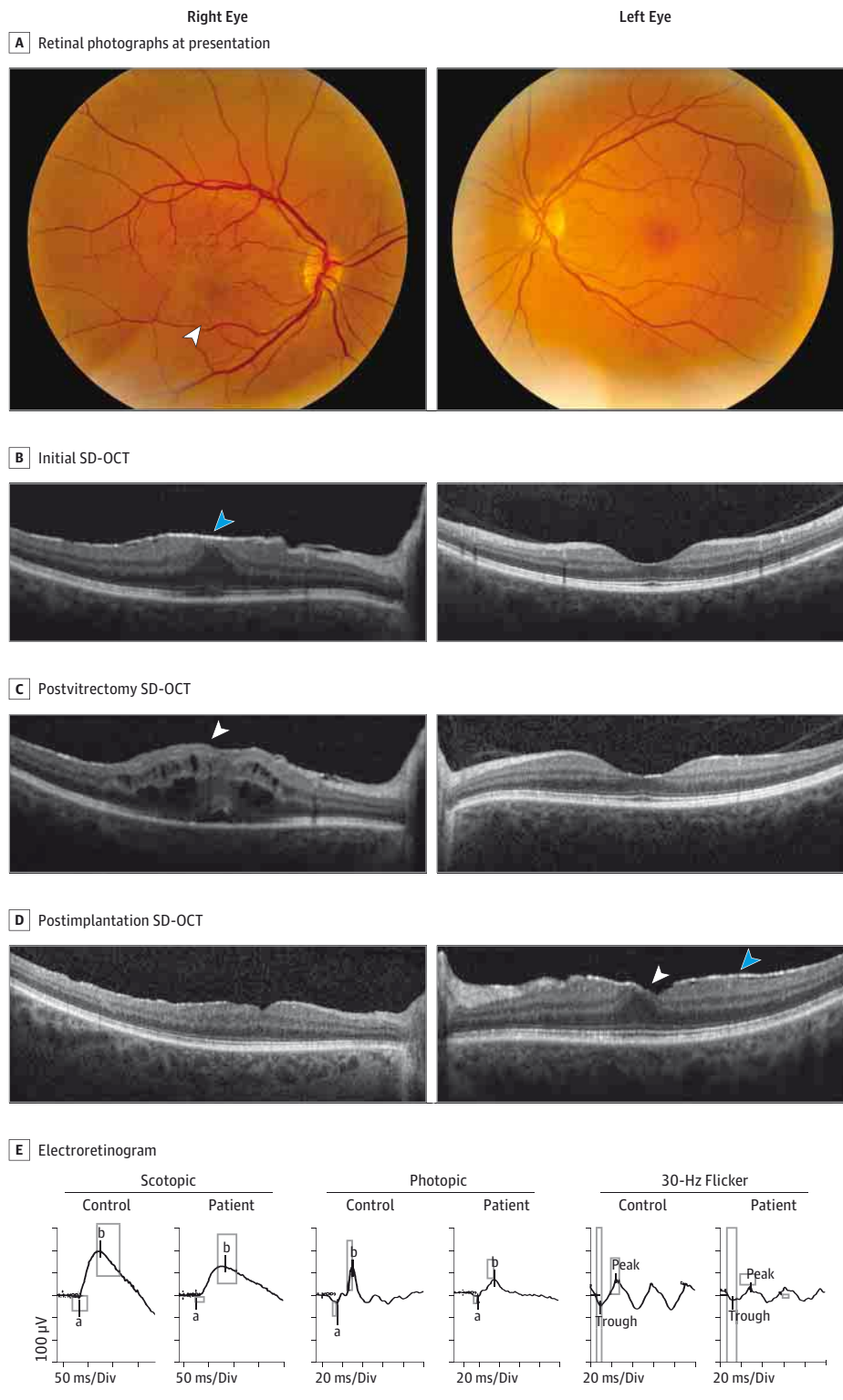
Figure 1. Clinical Course of Idiopathic Inflammatory Eye Disease With Persistent Retinal Edema Before and After Personalized Proteomics

The patient had a visual acuity of 20/70 OD and 20/20 OS. A, Her right eye had an epiretinal membrane at presentation (white arrowhead); the left eye was normal. B, Spectral-domain optical coherence tomography (SD-OCT) confirmed the epiretinal membrane (blue arrowhead) and moderate cystic retinal edema in the right eye with a normal electroretinogram (ERG); the left eye had normal findings. C, The postvitrectomy SD-OCT showed relapsing retinal edema (white arrowhead) with 20/70 visual acuity OD, despite intermittent intravitreal corticosteroid injections, and normal findings in the postvitrectomy left eye. The personalized proteome of vitreous fluid biopsy indicated an antiretinal antibody autoimmune reaction (described in Figure 2). After implantation of a controlled-release fluocinolone acetonide device (Retisert; Bausch & Lomb), retinal edema resolved without any relapse, and her visual acuity stabilized to 20/30 OD. D, The left eye eventually developed retinal edema (white arrowhead) and an epiretinal membrane (blue arrowhead). E, The later ERG showed abnormalities consistent with retinal inflammation. The scotopic rod-specific ERG waveform was within a normal range. However, the transient photopic wave had a more than 3-ms delay in latency. In addition, the 30-Hz flicker was 50% below normal amplitudes with a 2-ms delay in latency. Div indicates division.